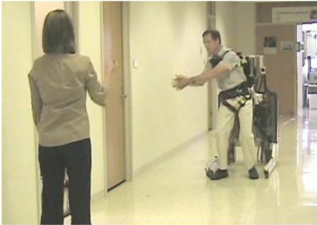
Figure 3. The KineAssist® in action as an individual plays catch with the therapist. (Both the patient and the physical therapist are employees of Kinea Design LLC.)

walking more difficult in training using perturbations and forces that destabilize. When the patient leaves such rehabilitation settings, we hypothesize that they will have learned more and perhaps have minimized a motor deficit. Such novel but easily programmable strategies are now possible with such a robotic device, and a new and widely imaginative set of possibilities are now realizable with this new technology.