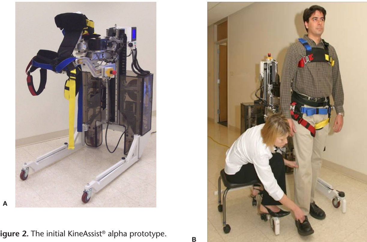
Figure 2. The initial KineAssist® alpha prototype.

system virtually undetectable and allowing easy forward and turning motions while the machine moves in response to the motion of the patient. Force sensed at the pelvic harness is used to drive the motion of the system. The trunk and pelvis mechanism allows the patient's bending motions both left-right, forward-backward, rotations about a person's transverse axis, and hip rotations about the forward axis. A torso mechanism attaches at chest level and can prevent collapse of the trunk. A software-driven "safety zone" limits the patient's upper body range of motion where the trunk support implements an adjustable, compliant constraint that catches the patients when they lose balance. In addition to simply acting as a fall-arresting device, this device can partially support the patient's weight at the level of the pelvis, and the system is also capable of comfortably applying forces to the body. The therapist has the freedom to change parameters and assist or challenge the patient to the level that is necessary to gain the best clinical outcomes.